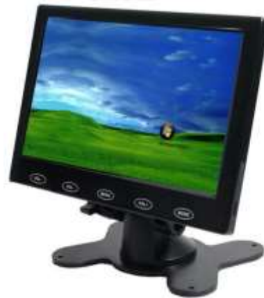
TFT (Thin Film Transistor)