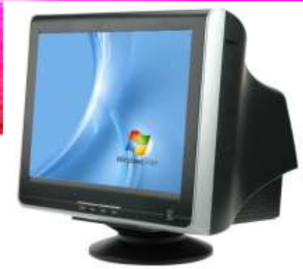
CRT (Cathode Ray Tube)