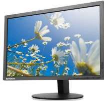
LCD (Liquid Crystal Display)