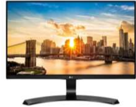
LED (Light-emitting diode)